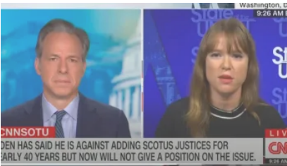
Jake Tapper Slams the Biden Campaign Oct 11 In "News"