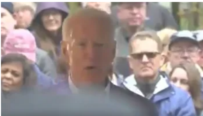
Joe Biden, Systemic Racist Oct 9 In "News"