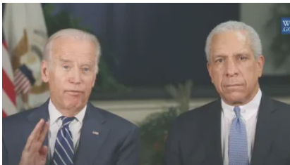
WATCH: BIDEN in 2016: "Every [Supreme Court] Nominee, Including Justice Kennedy in an Election Year, Got an Up or Down Vote By The Senate..." Sep 20 In "News"